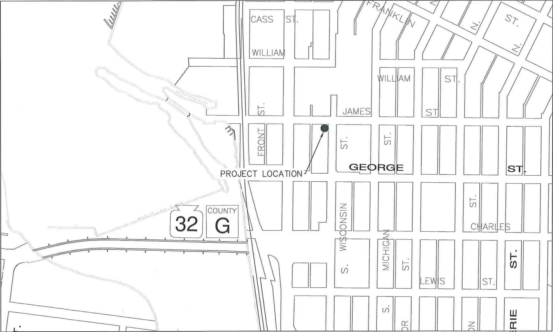
SITE LOCATION MAP N.T.S.

ENGINEER DIVISION 925 S. SIXTH ST DE PERE, WI, 54115