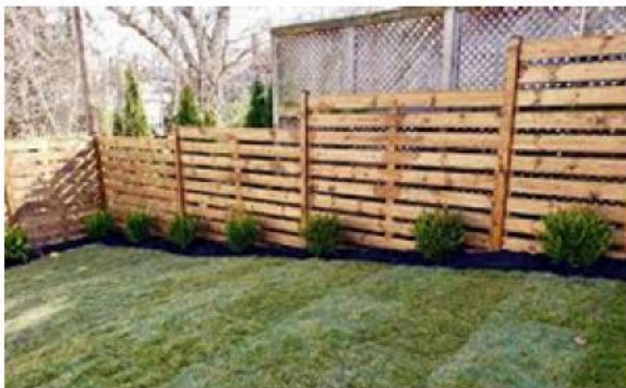
Prohibited horizontal fence style