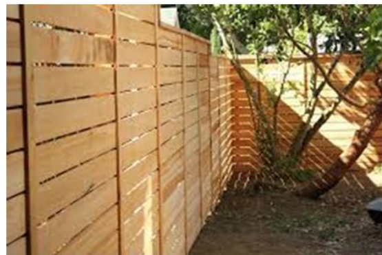
Appropriate Horizontal fence with less than 1" gaps