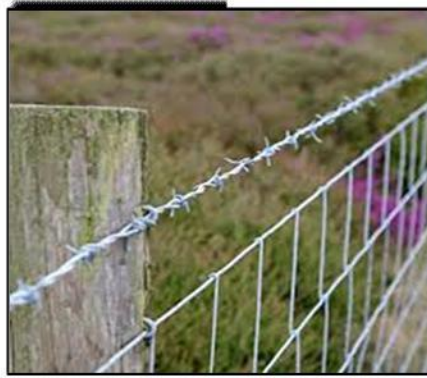
Barbed Wire and Deer fencing