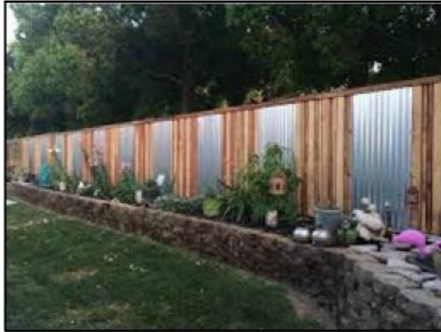
Mixed Material (must get approval)