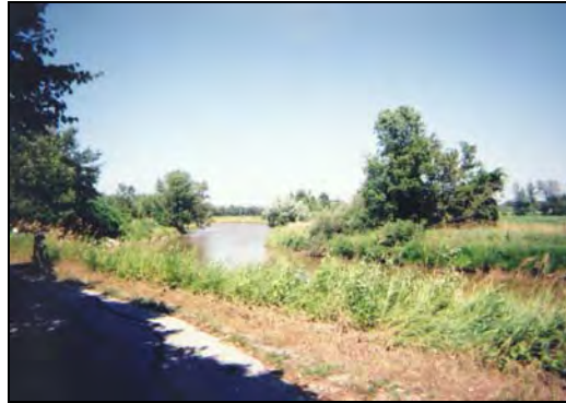
East River and the East River Trail

As of 2009, the City of De Pere and Village of Allouez continue to cooperate on an informal basis with primary communication occurring on a department to department basis for individual projects.