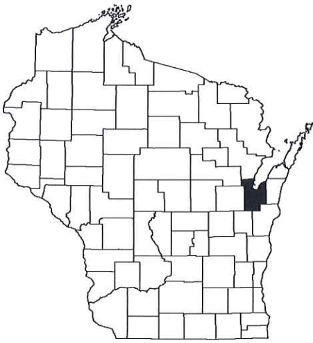
Brown County, Wisconsin