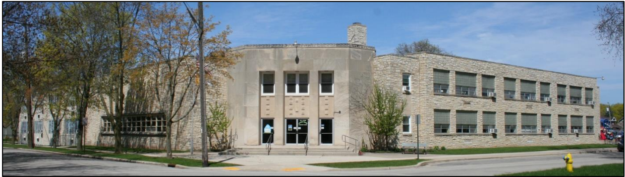
100 S. Huron Street: St. Mary Catholic School.