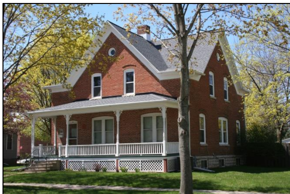
402 S. Michigan Street: Amil and Lesetta Schink House.

Rising from a rusticated stone foundation, this two-story, cross-gabled house is faced with red brick. Oriented to the east, a hipped-roof, open porch with turned posts, a simple wooden railing and modest porch work detailing shelters the primary entrance (at far left/south), along with two pair of double-hung sash. Segmental arches comprised of three rows of flush header brick top the door, as well as both windows, with the latter openings featuring stone sills. On the second