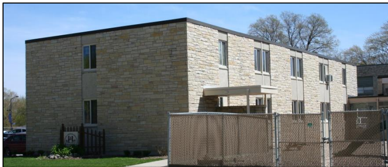
133 S. Superior Street: School Sisters of Notre Dame /St. Mary Catholic Convent.