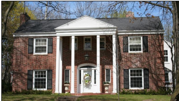
815 Nicolet Avenue: Edward F. and Jean Kohl House.

Rising two stories and side-gabled in form, this Neoclassical Revival-style house is clad with brick and brick quoining trims each corner. Dominating the symmetrically arranged, primary (south) entrance elevation is a gabled two-story portico with a series of four, square wooden supports. The portico pediment is sheathed with clapboard and trimmed with dentils below; additional dentil trim runs beneath the roof's eave. Beneath the portico and along the first floor, the central doorway is flanked with narrow sidelights and topped with a transom, all of which is set within a wooden surround beneath a soldier brick header. A single, rectangular window is located to either side of the entry, while a series of three double-hung sash occupy the second level beneath the portico. The remaining wall space carries four regularly spaced, double-hung sash with shutters; the first-floor examples are eight-over-twelve-light examples, while the upper story are eight-over-eight.