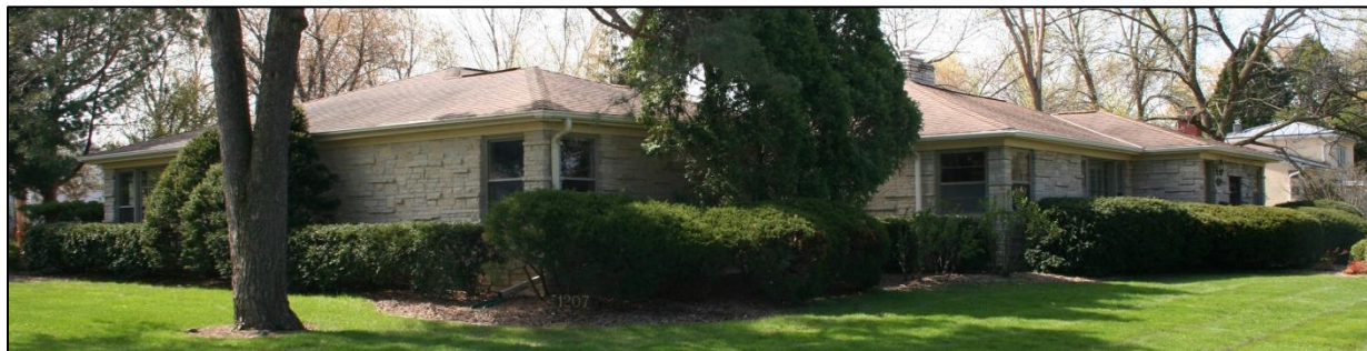
1207 Fox River Drive: Vincent and Mary Jacobs House.

Sheathed with limestone and encompassing over 3,000-square feet on its main level, this sprawling four-bedroom Ranch house is topped with multiple hipped roofs. Primary entrance to the home is gained through a single, multi-paneled door along Fox River Drive and within the southernmost block. Three-light picture windows, the center of which is comprised of multiple lights, are evident along both of the street-facing elevations of the house, while additional windows are double-hung examples with either one-over-one-light or two-over-two, horizontal-light sash. Incorporated into the house is a rear porch enclosure, as well as a two-car garage that is accessed off of Wilcox Road.