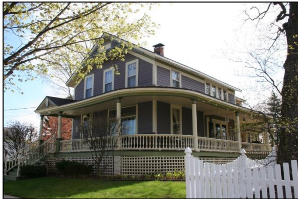
833 Fox River Drive: Campbell-Ruel House.

Sheathed entirely with clapboard, this two-story, front-gabled house is dominated by a one-story, open porch that covers the entire west elevation and wraps around to extend along the full south elevation of the main block of the house. A full pediment with columnar supports frames the porch entry, with additional columns supporting the remainder of the porch that features a spindled railing. A variety of windows are located throughout the house, with the second-floor