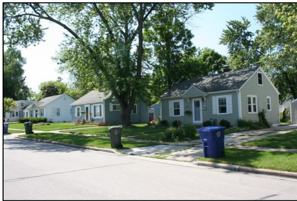
928, 932 and 938 Mansion Street (right to left).

This small residential historic district is comprised of fourteen single-family houses located to either side of Mansion Street between S. Erie Street on the west and Jordan Road on the east (See map on page 20). All of the two-bedroom homes are generally side-gabled in form and average about 700 square feet in size. All but one of the houses has been re-sheathed with modern siding and windows replaced, but very few have undergone any significant additions (beyond a rear dormer or