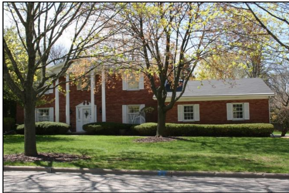
1326 S. Summer Range Road, Daviswood II Subdivision, Built 1973.

Situated immediately east of the aforementioned Daviswood Subdivision, the twenty-three, single-family homes in the Daviswood 1 st Addition 16 (hereafter cited as Daviswood II) are also arranged around a U-shaped roadway. Despite its location adjacent to two busy roadways (N. Webster Avenue and Ridgeway Boulevard) the subdivision, which is marked by a brick entrance marker, is rather secluded. While homes in the original Daviswood subdivision were (nearly) all