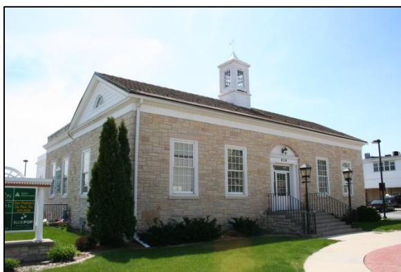
416 George Street: De Pere Post Office.

Completed in 1941 at a reported cost of $48,066, construction of the De Pere Post Office building was funded with Public Works Administration monies. The federal monetary award stipulated that the project not exceed $75,000, including purchase of a site. The site upon which the building is located was purchased from John Hahn for a sum of $10,000. Plans drawn by Supervising Architect Louis A. Simon were delivered to De Pere in August of 1940. The Colonial Revival-style structure called for native stone exterior walls, wooden windows, lamp standards and brass