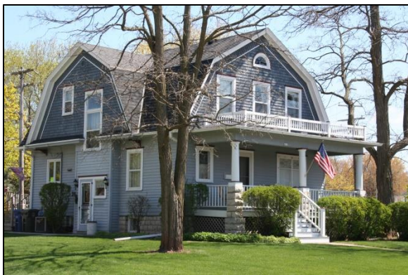
405 S. Wisconsin Street: Peter Heyrman House.

Oriented to the west, this two-story, Dutch Colonial Revival-style house rises from a rock-faced and coursed, stone foundation. Featuring a tri-color paint scheme, the first floor is covered with clapboard, while the upper story includes wooden shingle-sheathed, gambrel-roof dormers along three of its four elevations. A flat-roofed and open porch with wooden column supports and masonry piers extends across the home's west elevation and shelters the entrance, as well as two rectangular windows; the south one of which is larger than the other. A simple wooden railing completes the porch along both levels. Three regularly placed, one-over-one-light sash occupy the upper level, along with a lunette window at the peak. A modest rectangular projection that extends to the upper story includes a side entrance on the north, while a rectangular window bay is positioned along the south elevation and to the rear of the home. Windows throughout the remainder of the home are rectangular sash examples.