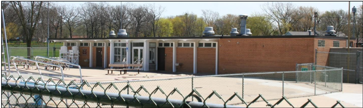
1212 Charles Street: Legion Park Bathhouse and Pool.

Faced with brick, this one-story bathhouse is topped with a flat roof with a wide, overhanging eave. Exposed pre-cast concrete supports vertically articulate much of the building's exterior; narrow, clerestory lighting is located immediately beneath the roof overhang. Two pair of steel doors are located along the rear (south side) of the building, while glass double doors are found along the pool-facing elevation. A standard pool and decking is located to the north of the bathhouse, while a wading pool is located to the northwest. West of the bathhouse is an open pergola. A metal fence encloses the pool facilities, with the bathhouse forming the rear enclosure.