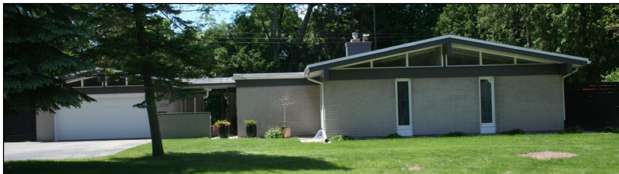
1336 Ridgeway Boulevard: Mrs. Agnes Lenfestey House.

Contemporary in style and with limited detailing, this one-story, cement-brick house is comprised of two, separate, low-pitched and front-gabled units that are connected via an open but covered passageway that includes the home's entrance. Oriented to the north, the main (west) block features only a pair of symmetrically placed, floor-to-ceiling, tall-and-narrow, plate-glass