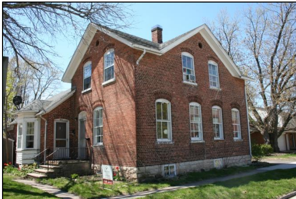
514 Lewis Street: Peter and Catherine Toonen House.

Regarding the gabled two-story block, its street-facing elevation is symmetrically arranged and includes a central gabled wall dormer; four, two-over-two-light, double-hung windows line the first floor while two are located along the second level. A circular window is located within the gabled peak of this elevation, as well as along the east and west facades. All fenestration along this elevation, as well as its endwalls, are topped with an ornate segmental-arch, brickwork header comprised of four rows of brick, the second and fourth rows are flush with the wall, while the alternating rows project from the wall. The home's entrance is oriented to the east and located at the main block's juncture with the one-story wing to the rear, the latter of which also includes an entrance. Evident along the east side of the rear wing is a three-sided bay that is partially sheathed with clapboard and includes six-over-one-light, double-hung sash.