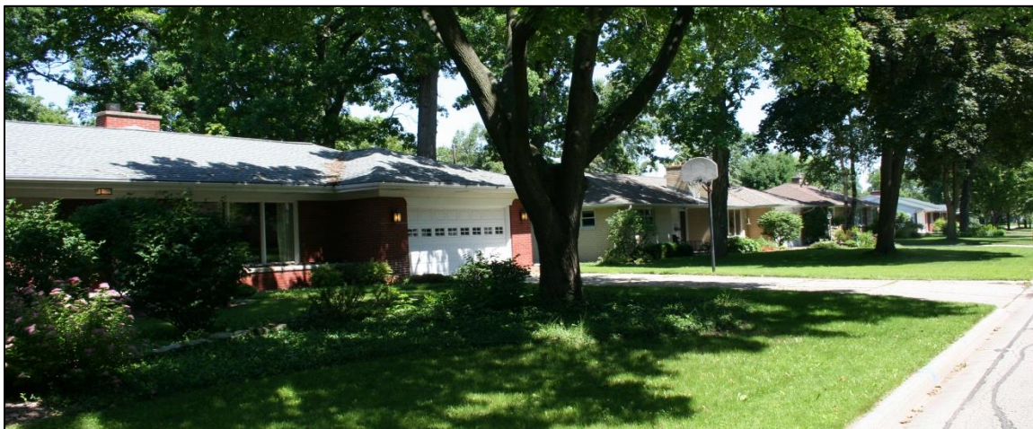
Ranch homes along E. St. Francis Road, west side, Daviswood Subdivision.