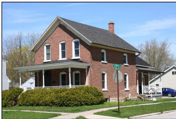
621 Lewis Street: Doak-Dart-Mularky House.

Clad with brick, this two-story, gabled house is comprised of a two-story, front-gabled block along Lewis Street from which a one-and-one-half story wing extends to the rear (north). An additional brick-clad wing extends to the west from the rear corner of the two-story block. Regarding the two-story block, it features a modest wooden cornice beneath the roof's eave and a hipped-roof, open porch with turned supports and a replacement railing that extends