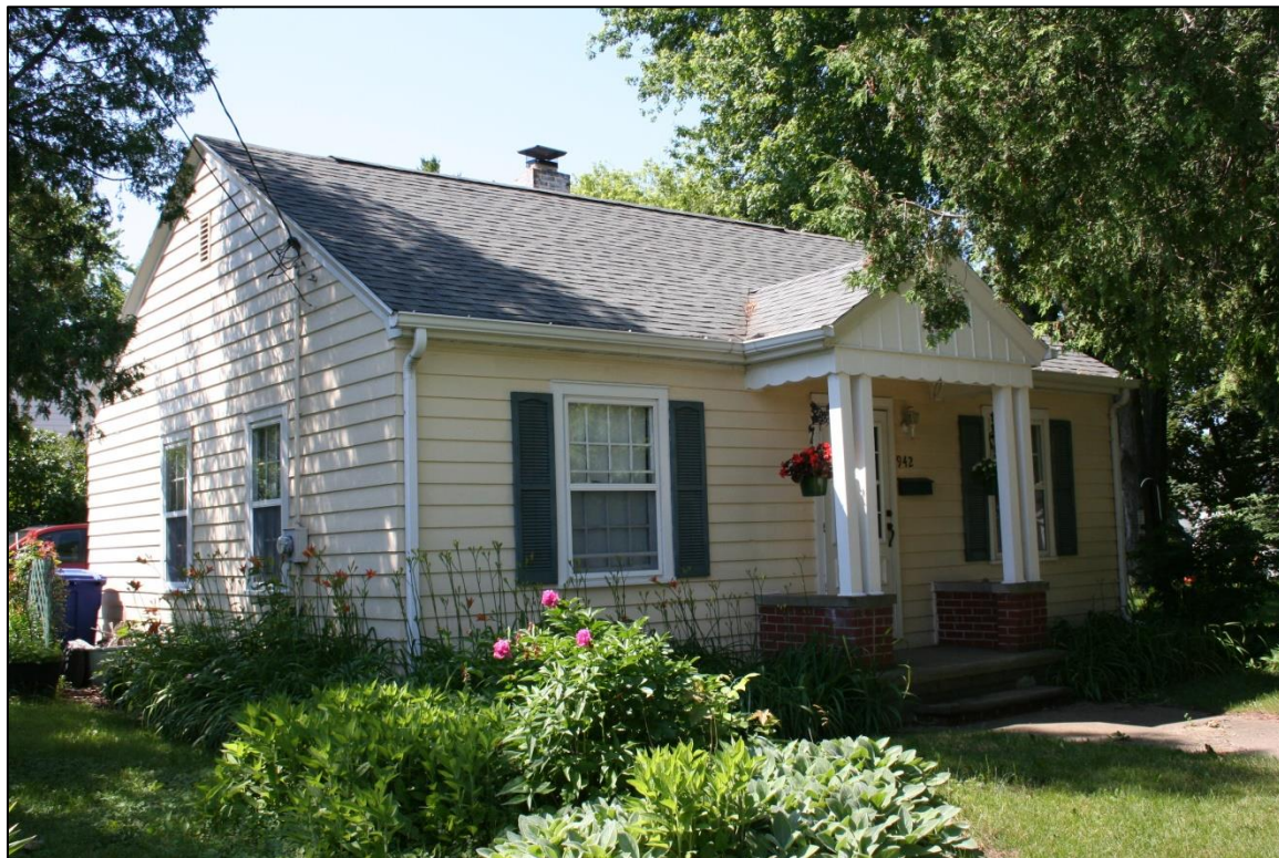
942 Mansion Street, built by the Standard Lumber & Fuel Company, 1942.