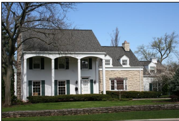
1218 Fox River Drive: Frank and Mildred Nickolai House.

Comprised of three side-gabled blocks of varying height, this Colonial Revival-style house is sheathed with a variety of materials including brick, limestone and what appears to be board siding. The southernmost block rises two full stories and is faced with brick that is painted white. A two-story, open porch with plain square supports fronts the entire elevation and shelters the right-of-center entrance that is topped with a transom and flanked by shutters. Shuttered,