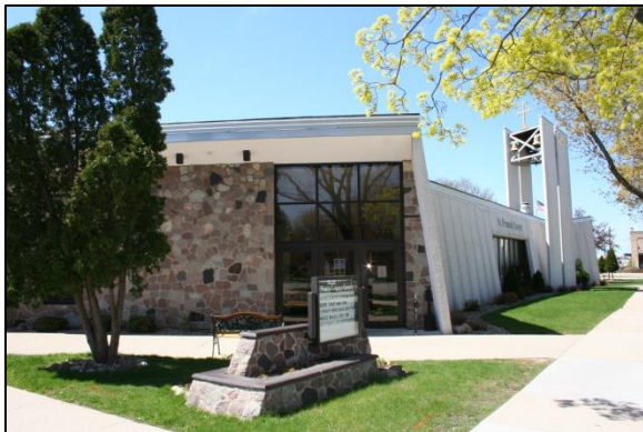
220 S. Michigan Street: St. Francis Xavier Catholic Church.