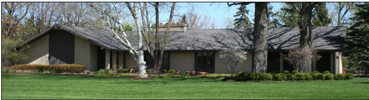
Above: 1339 N. Summer Range Road, Daviswood II, Built 1969.

No information was found to substantiate potential eligibility under Criterion A: History. Despite Bart Starr's involvement in the subdivision's development, and the fact that his house is located within it, no further information was found to substantiate eligibility for the district under Criterion B: Significant Persons. However, regarding Criterion C: Architecture, the subdivision of high-end, custom-built homes reflects most of the styles popular from the mid-1960s and into the 1970s. Although not yet fifty years of age and despite some modifications, the collection, which is further distinguished by its arrangement around a U-shaped driveway, should be re-evaluated in 2024, when all but two of the homes will have reached fifty years of age.