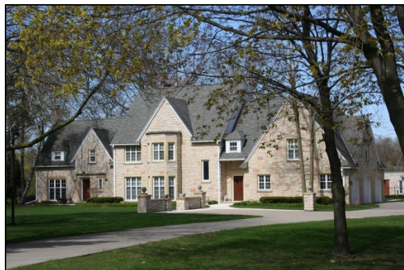
1334 Fox River Drive: Dr. Alden and Amalia Hudson House.

Sheathed with rough-cut limestone, this large Tudor Revival-style house is comprised of four blocks of varying height, all of which are topped with a slate-shingled, gabled roof. The (largely) central side-gabled block rises two-and-one-half stories and features at its center a two-story, five-sided bay set within a gabled wall dormer; the bay carries multiple-light, double-hung (or casement) windows along each level. Additional multiple-light windows are located to the left (south) of the bay, while a single, tall-and-narrow window is located to the right. Within the narrow, side-gabled, one-and-one-half-story block to its right, a wooden door is set within a stone surround and topped with a label mold; a hipped-roof dormer rises from the roofline above. An additional entry to the house proper is located in southernmost, one-and-one-half-story wing. The door and a small window are both topped with a stone label mold, both of which are set within a gabled wall dormer that carries a double-hung sash within the peak. Finally, a front-gabled, three-car garage wing completes the house on the north. Windows throughout the house are finished with smooth stone surrounds.