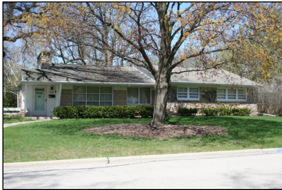
805 E. St. Francis Road, Daviswood Subdivision.

Located north of Ridgeway Boulevard and east of Urbandale Avenue, this residential district consists of thirty-four, single-family, Ranch-style homes and one non-contributing 1950s Contemporary-style home arranged around St. Francis Road, a U-shaped roadway. Exterior sheathing includes any number of combinations of the following: stone veneer, board, brick veneer, wooden shingles, board-and-batten, as well as vinyl or aluminum. Some of the homes retain their original windows (some with horizontal-pane sash), while others have been replaced with one-over-one-light sash.